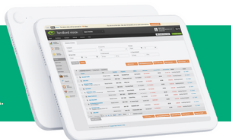
A typical display ad